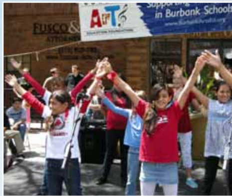
Burbank Arts for All Foundation – supporting arts education in the Burbank Unified School District