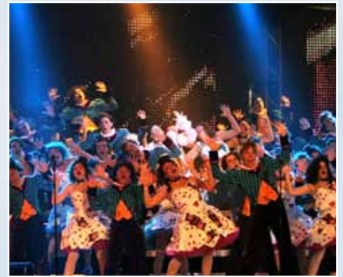
John Burroughs HS Vocal Music Association – America's premier high school vocal music program

Help support the future of our youth in perpetuity through a permanent contribution to any of these funds today! See Page 1 for information on how to make your donation.