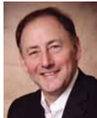
Arye Gross Actor