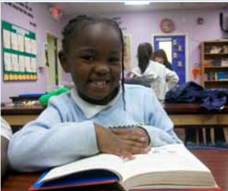
Boys and Girls Club of Burbank/ Greater East Valley – programs from sports to arts to tutoring and mentorship

We are proud to manage Agency Endowment Funds for the following nonprofits: